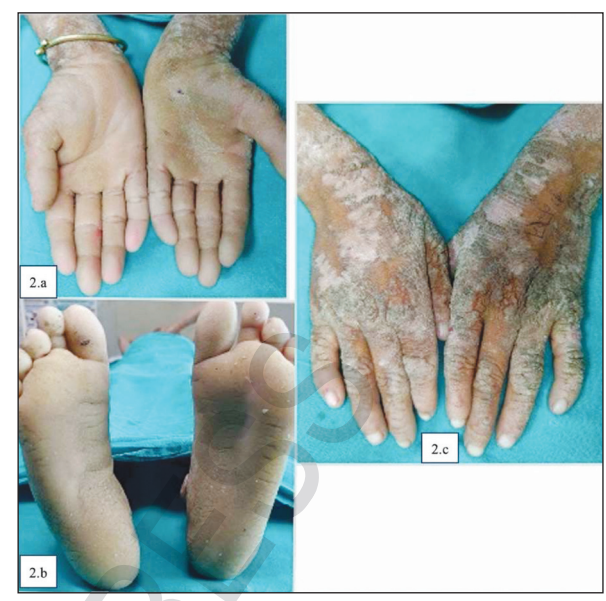
FIGURE 2: A-B) Diffuse non-transgradient palmoplantar keratoderma. C) Thickened, vertucous dark brown spiny scales over dorsum of hands with normal nails.