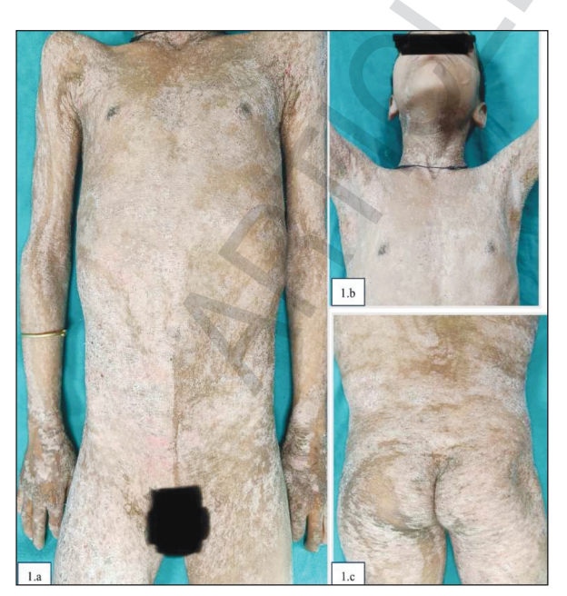
FIGURE 1: Generalized thickened, verrucous dark brown spiny hyperkeratotic scales and ridges in a blashkoid pattern over (a) trunk, (b) neck and axillae with relative sparing of face (c) back.

Skin biopsy showed hyperkeratosis, acanthosis, and papillomatosis with thickened granular layer (Figure 3). Perinuclear vacuolization and coarse keratohyalin granules in upper spinous layers (Figure 3). Mild lymphocytic infiltrate was seen along dermoepidermal junction. Electron microscopy could not be performed due to financial constraints.