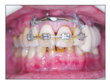
FIGURE 4: Vertical elastic force was applied from the maxillary left lateral incisor to the metal extension of the implant-retained fixed partial denture to intrude and correct the maxillary incisor's occlusal cant.