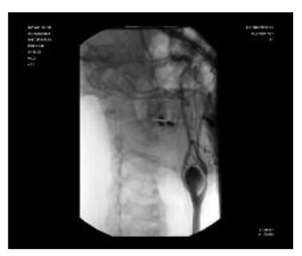
FIGURE 1: Selective digital substraction angiography of the left internal carotid artery pseudoaneurysm (25x15 mm) before endovascular therapy.

Examination of the injury side revealed a 1cm wide wound due to penetration of a sharp object in the one-third mid region (Zone II) of the left sternocleiodomastoid muscle and a wide, non-pulsatile hematoma. We did not observe acute bleeding in the penetration zone. At the operation, a 10 cm in length longitudinal incision made through the medial side of the left sternocleiodomastoid muscle and during exploration, we did not detect any injury to the main carotid artery or its branches macroscopically; however, two lacerations with 1cm in length were in the medial and lateral sides